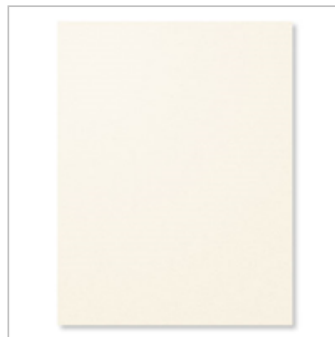
Very Vanilla 8-1/2" X 11" Cardstock