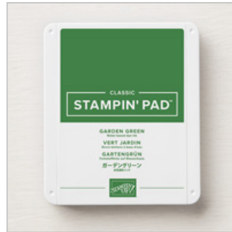
Garden Green Classic