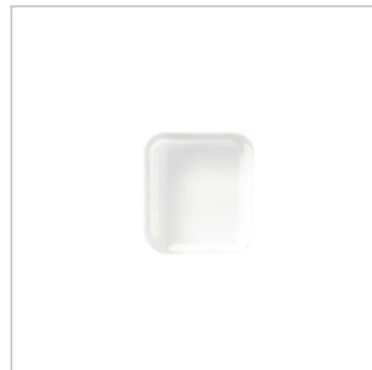
Clear Block A