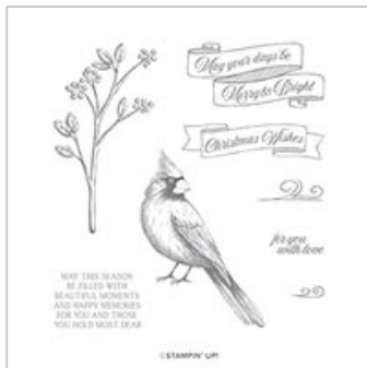
Toile Christmas Cling Stamp Set (En)