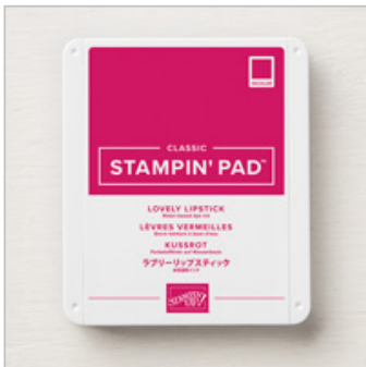
Lovely Lipstick Classic Stampin' Pad