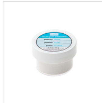
White Stampin' Emboss Powder