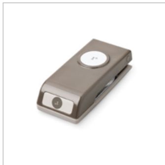
1" (2.5 Cm) Circle Punch