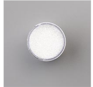
Ice Stampin' Glitter