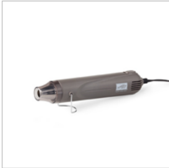
Heat Tool (Us And Canada)