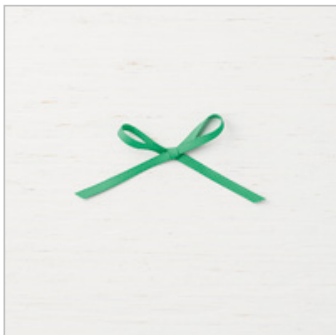
Call Me Clover 1/8" (3.2 Mm) Grosgrain Ribbon